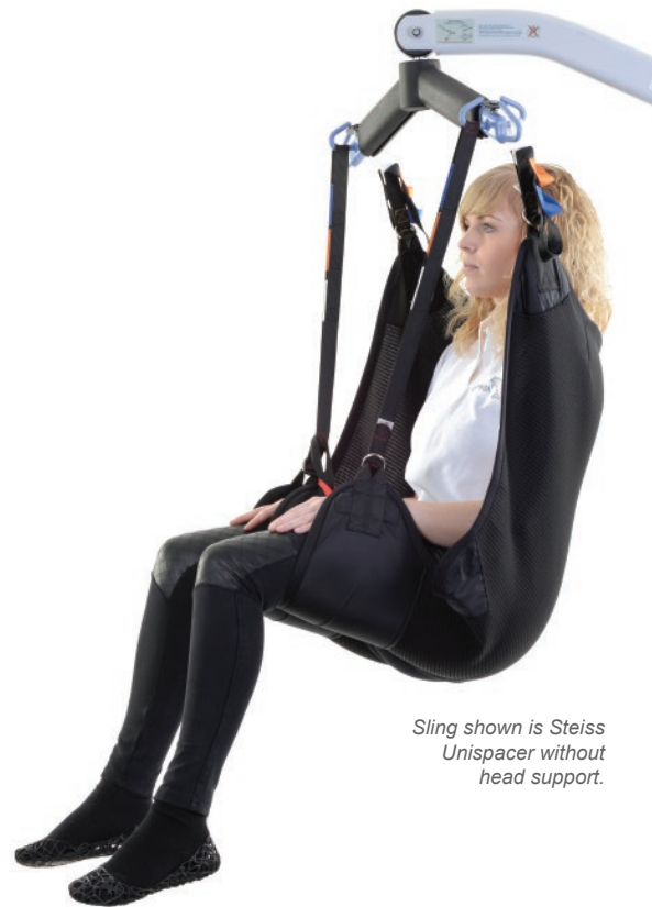
Sling shown is Steiss Unispacer without head support.